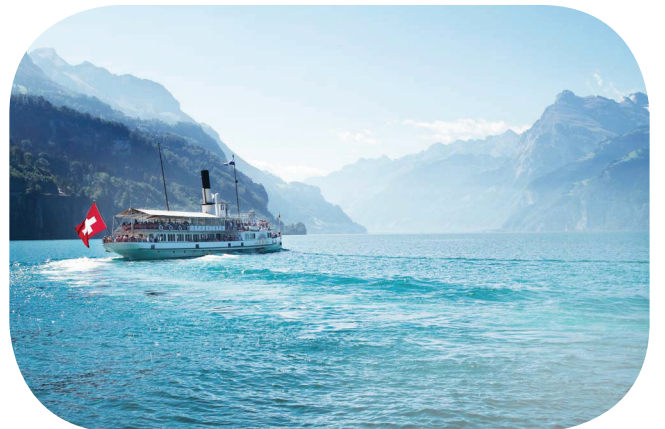
Lake Lucerne (Vierwaldstättersee)