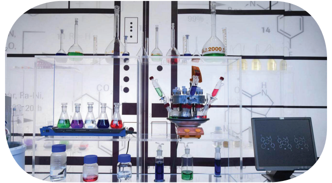
Laboratory of the pharmaceutical company Roche