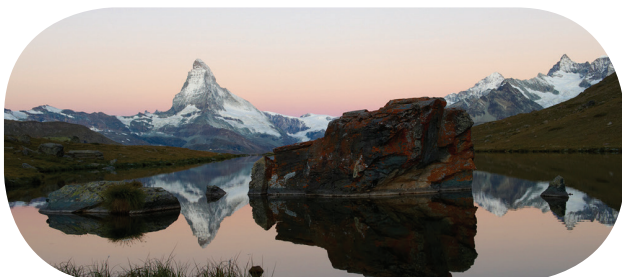
Zermatt - Matterhorn (4'478m)