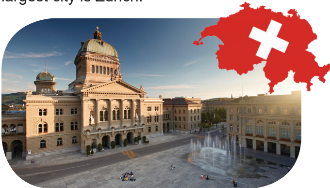
Bern - federal parliament