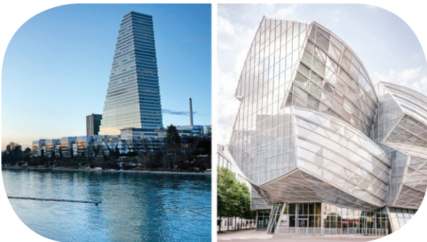
Headquarters of Roche (left) and Novartis (right) in Basel