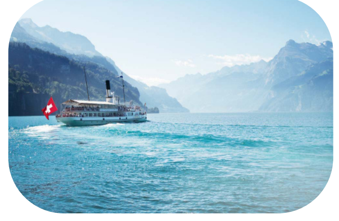
Lake Lucerne (Vierwaldstättersee)

The Swiss eat more chocolate than any other nation in the world – they eat a record of around 11kg per year.