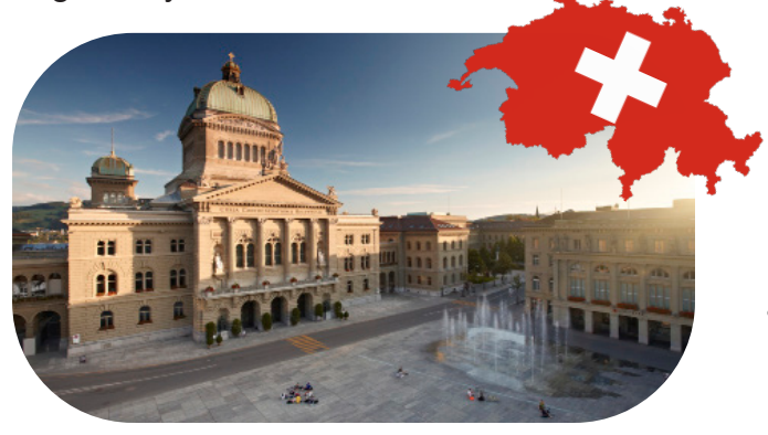
Bern - federal parliament