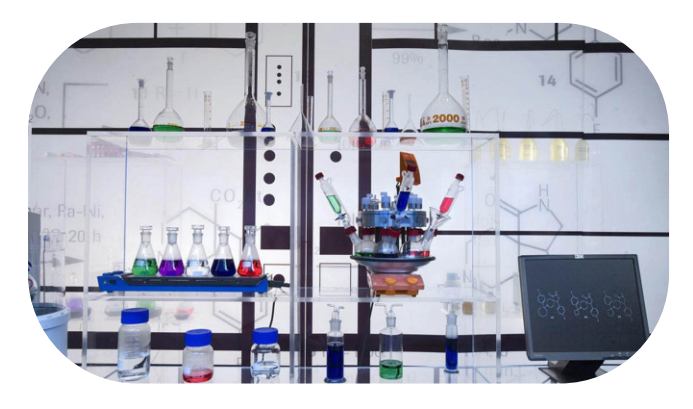
Laboratory of the pharmaceutical company Roche

Between 2007 and 2017, Swissmedic approved a total of 219 medicines with new active ingredients developed by Interpharma companies. Most of the approvals were in the areas of cancer and vaccines, followed by drugs for blood diseases.