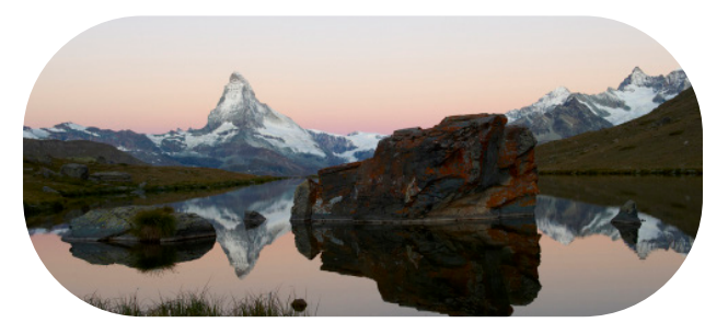
Zermatt - Matterhorn (4'478m)

Switzerland's Gotthard tunnel is the longest in the world – measuring 57km in length, located 2.3km under the Alps. Of course there is also a pass road over the Alps.