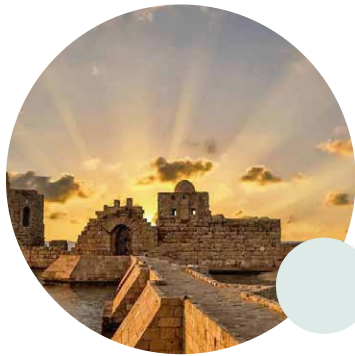
SAIDA SEA CASTLE