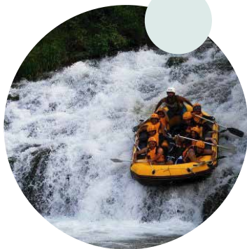
NAHER L ASSI